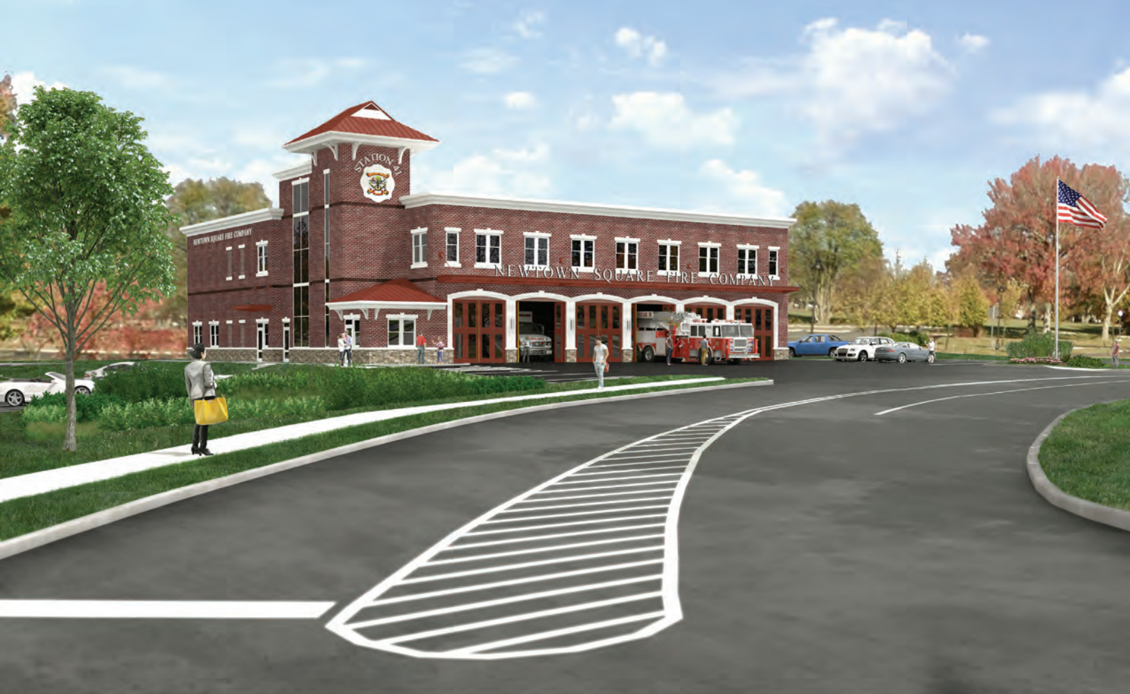
CONCEPT IMAGE NEWTOWN SQUARE FIRE COMPANY NEWTOWN, PENNSYLVANIA